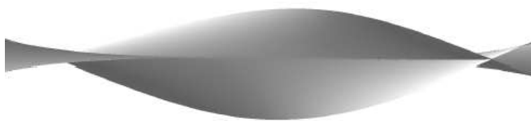
FIGURE 1. The singularity appearing in Example 2

By construction, we are in the small cell \mathcal{P}_1 precisely at z = 0 , and at this point we obtain a singularity (Figure 1) which appears to be what is sometimes called a Shcherbak surface singularity [7].